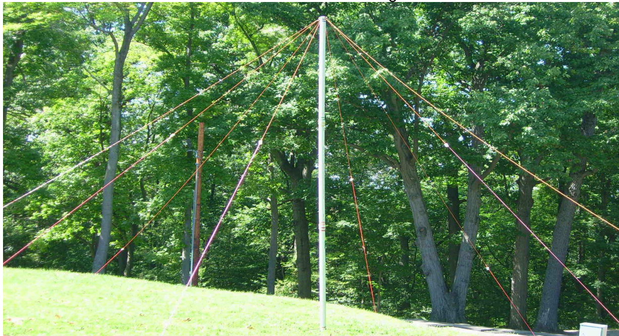
Antenna showing 4 inverted Vee's, 8 wires total, 40M, 20M, 15M, & 10M bands.

The article published in July 2011 “Multi-Band Inverted-V Antenna” covered the construction and tuning of the antenna. This article covers the field results using the antenna.