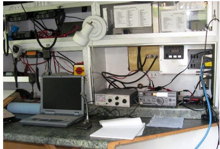
▲ In the A.R.E.S. communications van.