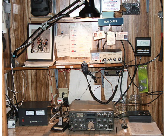
▲ N8KRR, Ron's radio station.

Equipment: Kenwood TM-241A/2m; Kenwood TS-830/ HF; Kenwood MC-50/mic; Astron RS-20m/power supply; MFJ Deluxe Versa Tuner III; Heathkit “Cantenna “Dummy Load””; straight key; Davis Weather Wizard III