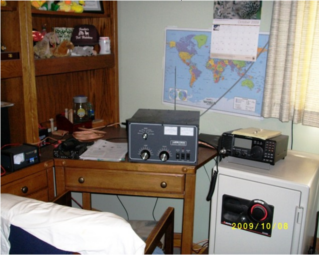
▲ K8CAA, Craig's radio station