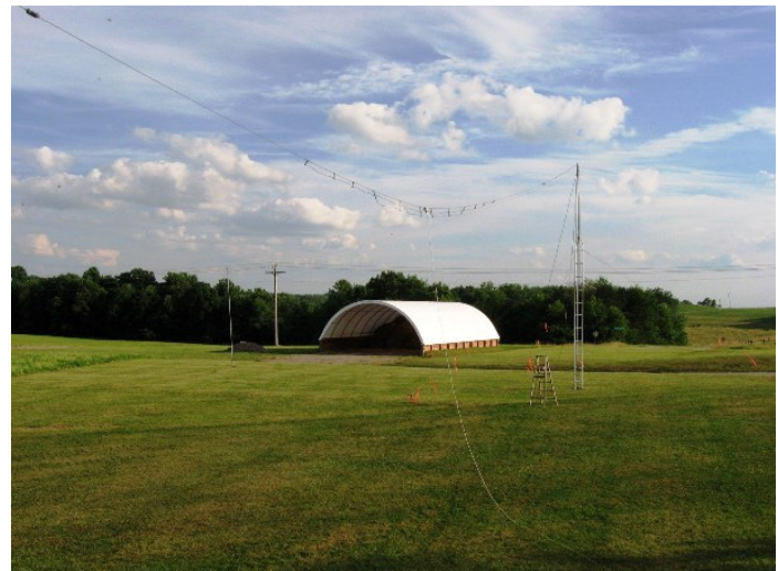
▲ Shelter at the Water Shed.