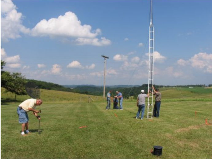
▲ Here are some of the guys setting up the tower and antennas for the event on Friday afternoon.

Field Day was June 27th and 28th. We had a great new location this year. It was at the USDA Experimental Water Shed on SR 621N. We had a voice, PSK-31 Digital, and a CW station operating. Check out the view!